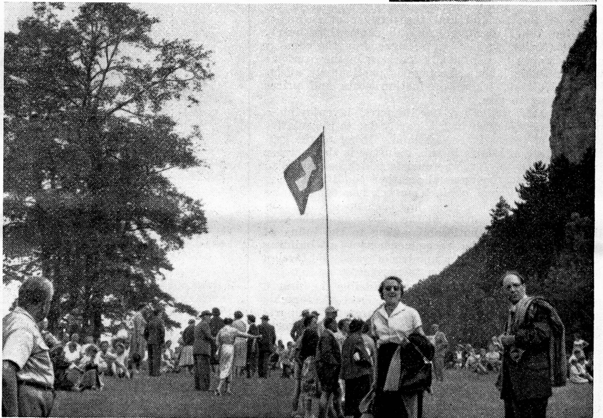
After a memorable excursion on the lake of Lucerne aboard "Schiller", our guests from abroad went to the Rütli to celebrate the 1st of August at the spot where the Confederation was born.