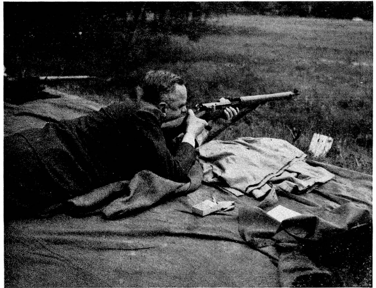
THE SWISS MINISTER IN ACTION.