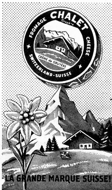
Famous all the World over for Quality and Tradition

To Basle, it will leave on Fridays, April 13th and 20th, at 23.05 and on Saturday, April 28th, at 00.05.