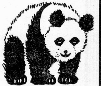
Regd. Trade Mark

Everyone adores them they're so so gay and colourful in a variety of designs :— stripes, spots, checks and tartans. Also self colours in satins, taffetas, failles and petershams. Ask for "Panda" and know you are buying the best.