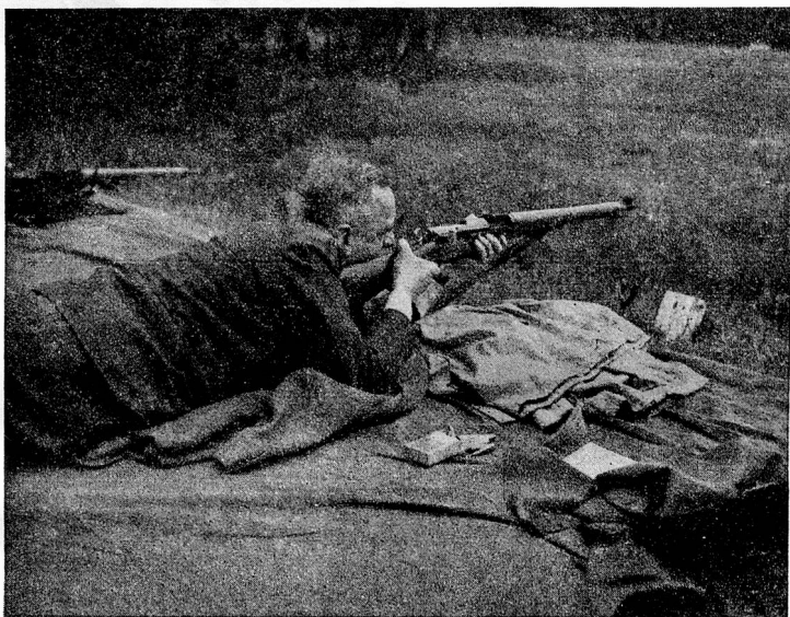
Swiss Ambassador in action.