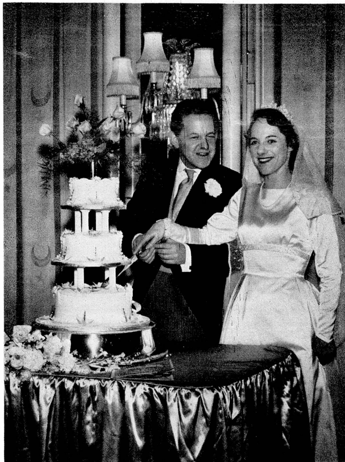
CUTTING OF THE WEDDING CAKE.