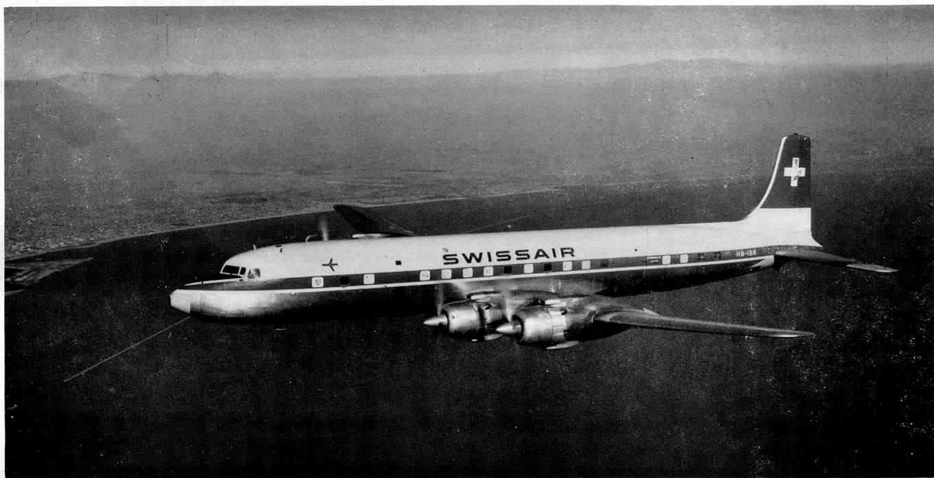
DOUGLAS DC-7C's ("SEVEN SEAS") FLY ON SWISSAIR ROUTE TO NORTH AMERICA AND WILL SOON ALSO FLY TO BRAZIL AND ARGENTINA. THE "SEVEN SEAS" ARE THE LARGEST RANGE AIRLINERS NOW IN SERVICE, WITH A CRUISING SPEED OF OVER 350 m.p.h.

Seventy-two services weekly will operate between the U.K. and Switzerland, including the twice-daily first class and tourist DC-6B "Super Swiss" from London to Zurich. Afternoon as well as morning departures and night services from London to Switzerland are available from the beginning of the summer Schedules with improved timings. Mid-week night return London-Basle or Geneva is £19.19.0. The daily London-Berne service will start on 25th May. Up to five flights weekly, including night services, link Manchester direct with Zurich. Services from the U.K. connect at Geneva or Zurich with flights to the holiday centres of the Continent and with all long-distance services.