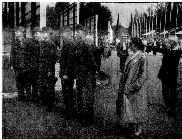
Some of the young recruits who have come from abroad to do their National Service (Picture above).

The Secretary of the «Home» will be pleased to accept your bookings, without any obligation, and will gladly supply any information desired about costs, schooling fees etc. Your wishes and suggestions are always welcome.