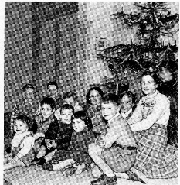
Happy children of Swiss families living abroad are celebrating their first Christmas in their homeland. Glückliche Auslandsschweizer-Kinder erleben im "Home" ihre erste Weihnachtsfeier in der Heimat.