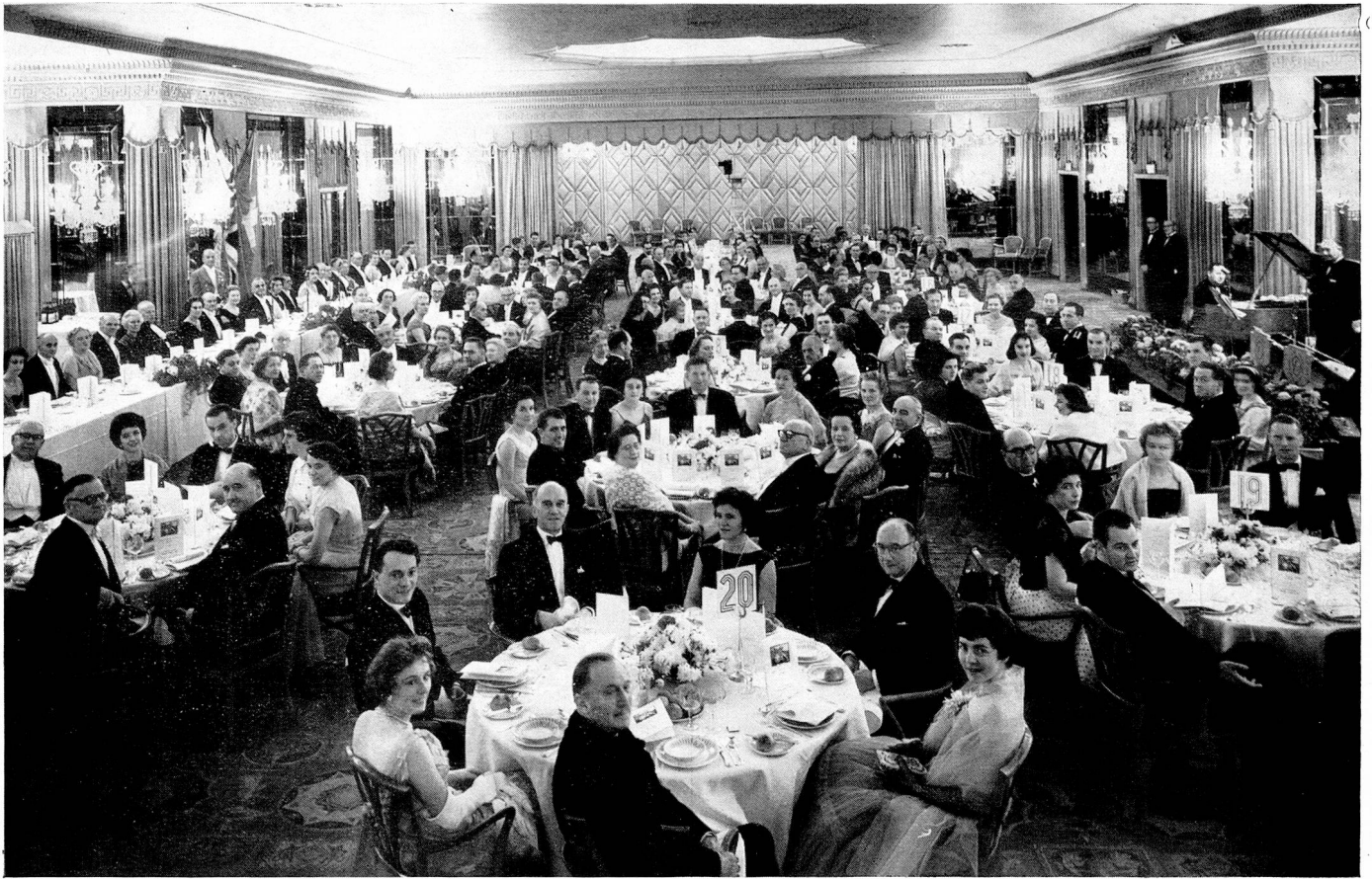
VIEW OF THE BANQUETING HALL.