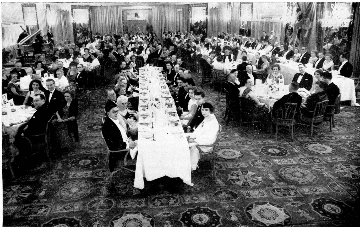
VIEW OF THE BANQUETING HALL.