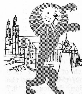
All UK - Switzerland flights are operated in association with BEA