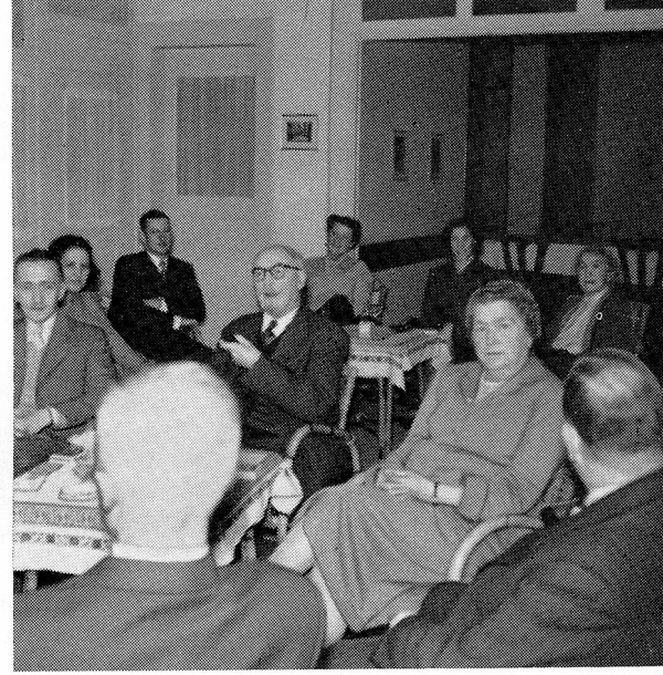
Auslandschweizer erleben in der glücklichen "Home"-Familie ihre erste Weihnachtsfeier in der Heimat. Swiss nationals living abroad are celebrating their first Christmas in their homeland at Dürrenäsch.