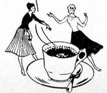
Nescafé is a registered trade mark to designate Nestlé's instant coffee.