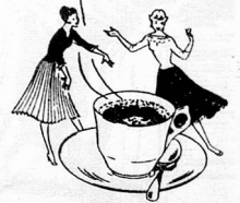
Nescafé is a registered trade mark to designate Nestlé's instant coffee.