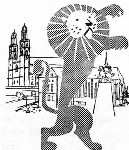
UK — Switzerland flights in association with BEA