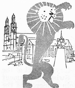
UK — Switzerland flights in association with BEA