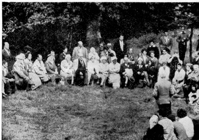
"Our Grütli in Yorkshire"