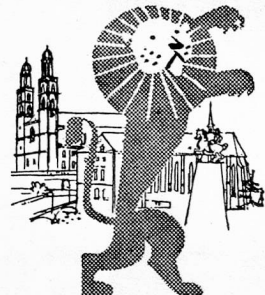
UK — Switzerland flights in association with BEA