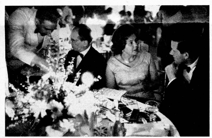
The Swiss Ambassador, Lady Wakefield and Lord Balniel at supper.