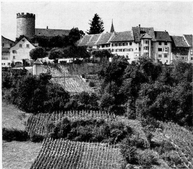
Swiss National Tourist Office 458 Strand, London W.C. 2