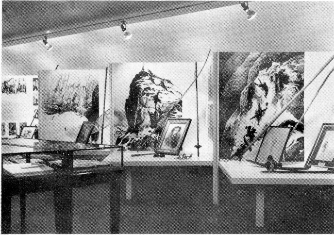
Exhibition in London ...

Since the first half of the nineteenth century, the Alps have become a haven of beauty to the nature lover, a challenge to the adventurer and a playground for the winter-sports enthusiast. Before then, they were considered by most Swiss as an enemy which hurled down torrents, stones and avalanches. There were many stories about the dragons which inhabited the Alps, even the guide books carried detailed descriptions and warnings about them. Many fearsome legends were woven around the peaks. Tales of death and of the evil spirits that haunted them.