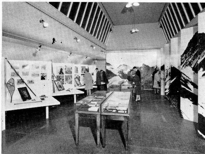
... in February.

Still, for a long while few people seemed to think of climbing for the joy of reaching the top. Eighteenth