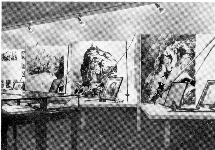
Exhibition in London ...

Since the first half of the nineteenth century, the Alps have become a haven of beauty to the nature lover, a challenge to the adventurer and a playground for the winter-sports enthusiast. Before then, they were considered by most Swiss as an enemy which hurled down torrents, stones and avalanches. There were many stories about the dragons which inhabited the Alps, even the guide books carried detailed descriptions and warnings about them. Many fearsome legends were woven around the peaks. Tales of death and of the evil spirits that haunted them.