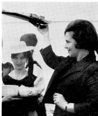
English tea and Swiss "Wähen" — another sign of the friendship between our two countries.