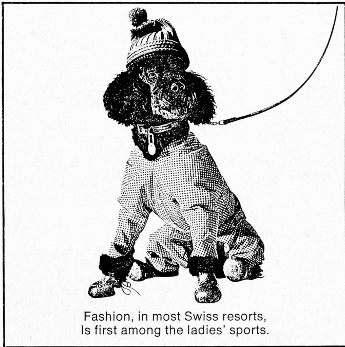
Fashion, in most Swiss resorts, is first among the ladies' sports.