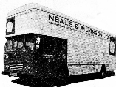
MEMBERS OF EUROVAN

REGULAR ROAD SERVICE TO SWITZERLAND AND OTHER EUROPEAN COUNTRIES