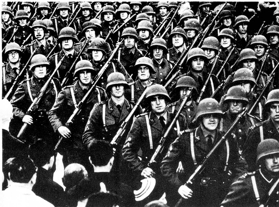
The Army that helped to keep Switzerland out of the war

The Swiss Army was busy tracking down spies and deserters. Hardly an issue