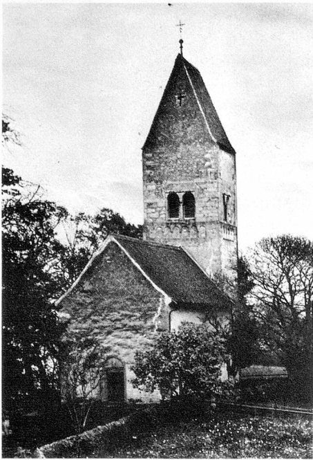
The charming small church on the Isle of Ufenau near Zurich.

one of the highest of that period, as well as the uniquely situated church of Negrentino . In spite of the last climb on foot in order to reach the church, we find it fascinating. The building itself is extremely simple and fits most aptly into the beautiful scenery. The interior contains superb frescoes which have a Byzantine touch, and this in the midst of the Swiss mountainside! Going up to the Lukmanier Pass we proceed past the proud Romanesque church tower of Olivone .