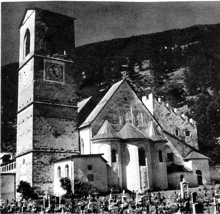
The church of Münstair, a jewel of Romanesque architecture.