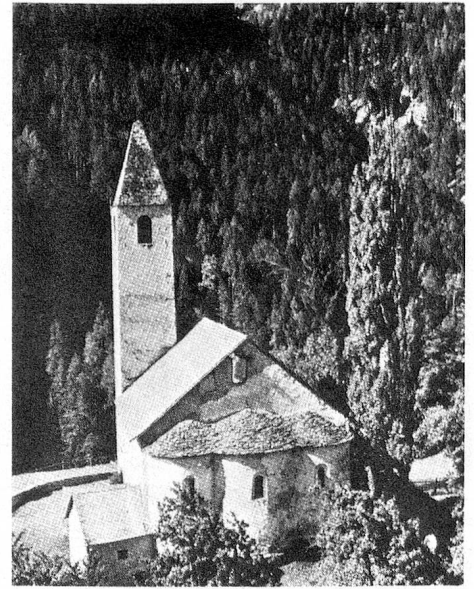
The pre-Romanesque church of St. Peter, at Mistail in the Grisons.

The last stage in our journey in the Grisons takes us to Santa Maria in the Münstertal. The group of Romanesque buildings of the Benedictine monastery founded by none less than Charles the Great, is something unique. Anyone interested in Romanesque Switzerland should visit Santa Maria, even if it is in the most remote corner of the country. It is thanks to its isolated position that the whole complex has remained pure and untouched. The church dates back to the eighth century, and is therefore rather pre-Romanesque. Its interior is completely painted. The three apses, its frescoes, the statue of its founder, the