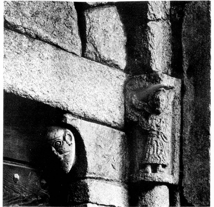
Sculptures on the church of San Nicolao at Giornico/Ticino.

Those who want to turn South already at Martigny, will find a specially lovely church tower at Bourg-St. Pierre, on the road to the Great St. Bernard Pass, shortly before the entrance to the motor tunnel. It is one of the oldest Romanesque towers on Swiss territory.