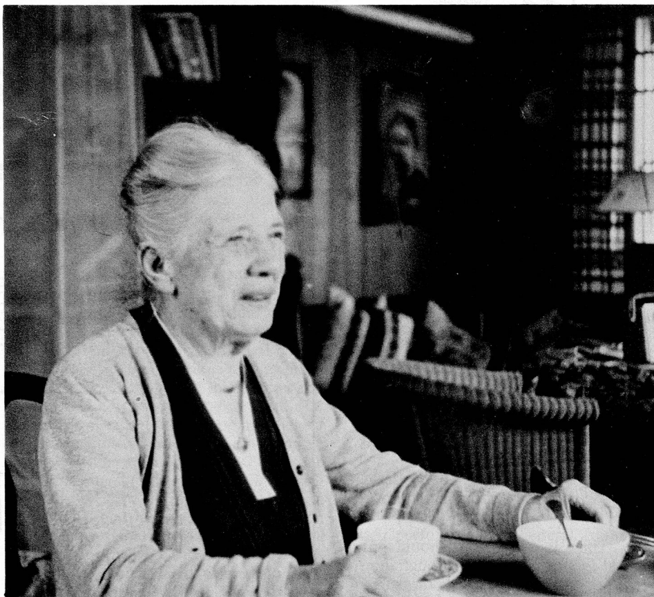
The peace of retirement

4. Further details appear in the "Leaflet on the voluntary insurance scheme for Swiss citizens resident abroad", which has just been reissued and takes account of the situation as from 1st January 1973. This leaflet can be obtained from any Swiss diplomatic or consular mission.