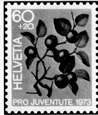
Edelkastanie Châtaigne Castagna