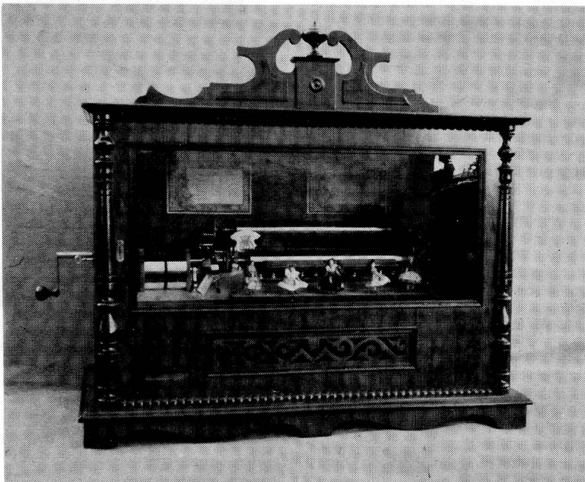
Luxury musical box manufactured in St. Croix in 1900.