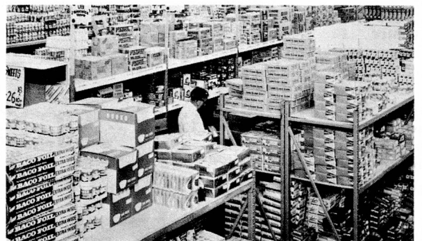
Series 70 MEDIUM DUTY 8,000 lbs. PER FRAME Racking for non-palletised merchandise. Clear spans up to 8 ft.

Acrowracks can be installed or adjusted to suit changing requirements quickly and at low cost. Find out more about them, telephone your nearest Acrow Branch Office today.