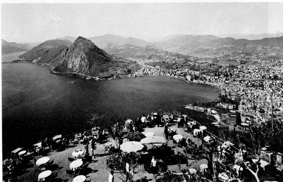
View of Lugano and Mount San Salvatore from Monte Brè.