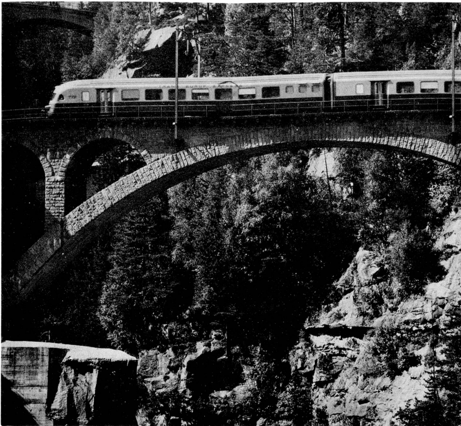
The Gotthard line at Wassen as it climbs over 600 ft. in a huge S-bend, crossing the Meienreuss torrent three times. Here the TEE train "Ticino", on its way from Milan to Zurich, crosses the middle bridge some 230 ft. above the torrent.

Four years later, the railway line from Locarno to Domodossola was planned. In order to carry out this daring project, many bold bridges of steel and concrete had to be constructed. In 1923, the first travellers were able to undertake the impressive journey, though many a passenger must have looked down into the awful gorges with some trepidation! One must not forget that this railway line consists almost entirely of bridges and tunnels apart from the stops on the way.