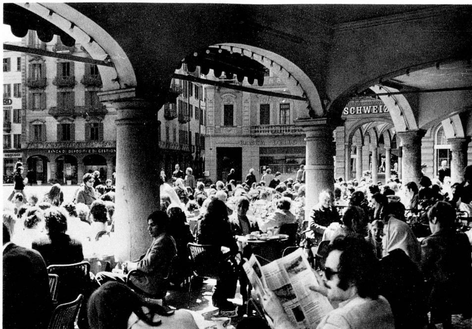
A relaxed holiday crowd in Lugano.

The Ticino has to contend with the same difficulties as the "classical" mountain Cantons Valais and Grisons. As an example, one only has to look back to