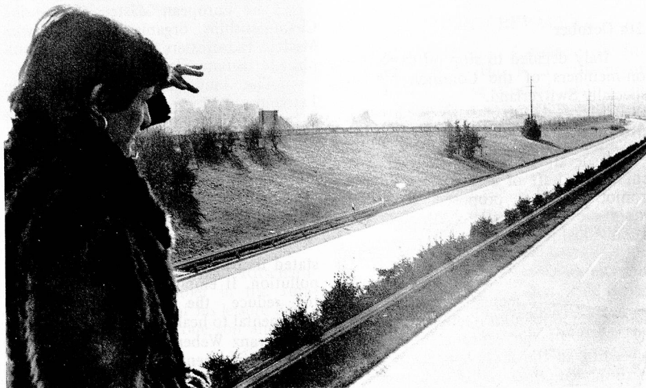
Deserted motorway during one of three traffic-ban Sundays last December.

The Federal Council announced that oil supplies were satisfactory, and that no further measures to save fuel would be ordered for the time being.