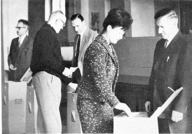
In the voting local (Keystone).