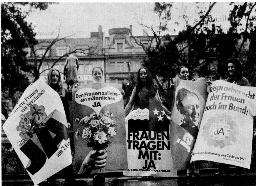
Pretty female messengers for the voting rights.

We are all born as individuals into a certain period and a certain background. The Swiss moral and legal standards accept every human life as of equal value, and thus everyone is equally entitled to the same