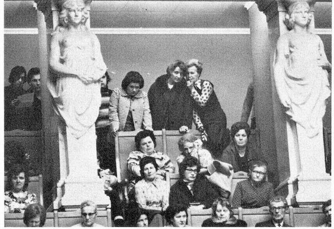
Listeners at the National Council.

special diploma schools which prepare pupils for social work, educational and nursing jobs; so far these have been frequented almost exclusively by girls.