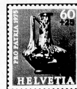
Coloured glass bottle