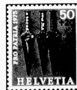
Solid-hilt bronze daggers