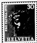
Head of a bronze statuette of Bacchus