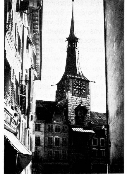
Clock-Tower in Solothurn (SNT0)