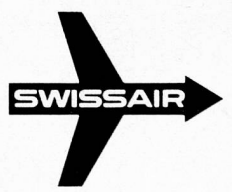
Connections from London and Manchester.

Summer timetable 1976, valid from April 1; subject to change.