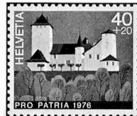
Murten / Morat