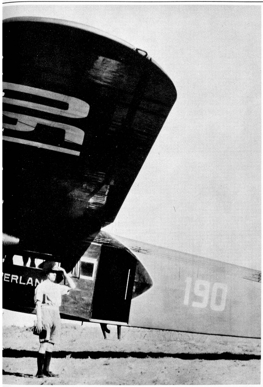
Walter Mittelholzer pictured in Nairobi just before taking off for the first flight over Mt. Kilimanjaro.

DC10. We'll also take you to Abidjan, Nairobi, Cairo, Casablanca, Dakar, Yaounde, Douala, Khartoum, Lagos, Libreville, Monrovia, Nairobi, Tunis and, starting this month, Oran as well. Six of these