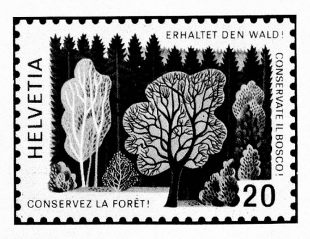
Fr. -.20 100 Years of Federal Forest Laws. The first federal forest law regulating the utilization and cultivation of forests at federal level entered into force in 1876. The special postage stamp designed by André Rosselet, Auvernier, and depicting a well-tended piece of woodland, calls attention to this important enactment and to the vital ecological role played by our forests.

But with these findings, nature's equilibrium was by no means reestablished. In the days from 27th September to 5th October 1868, cloudburst-like rains caused devastating damage in the Cantons of Uri, St. Gall, the Grisons, Valais and Ticino; boulderstone masses, stone avalanches and rocks inundated valleys and destroyed whole villages. 50 dead persons were