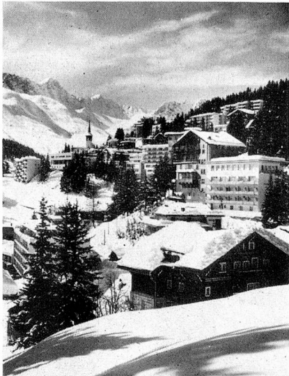
Arosa, one of Switzerland's largest winter sport resorts.

tury when the power constellations wanted to secure the Grisons passes. On one side were Austria, Spain, Milan and on the other Venice, where numerous Engadine emigrants lived, and France. Partisanship led by respected families like the Planta (in favour of the Austrians) and the Salis (Franco-phile) resulted in bad feuds, in which an adventurous figure like that of Juerg Jenatsch could live life to the full. Between 1649 and 1652, Austria sold her rights to the Grisons, above all to the relief of the Lower Engadine; the partisan struggles abated only gradually. The 18th century may be considered a happy period: politics and schools became aristocratised: the private schools of Haldenstein, Marschlin, were pioneering achievements of educational training; the arts and trade flourished. In 1798, the Grisons, as Canton Rhaetia, were united with the Helvetic Republic by Napoleon and became the 15th Canton of the Confederation as a result of the Acts of Mediation in 1803. The Canton gave itself a new constitution in 1814, but in fact it did not become a uniform political structure until 1854 with the demand