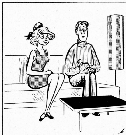
You see, that's why I knitted the arms so long.