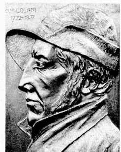
Hunter's head

As poet and narrator he writes above all in his mother tongue, the Ladin of the Engadine (poems, stories, essays, one-act plays, radio plays). More and more, he also writes in German, specially prose and dramatic works, as well as journalistic commentaries which appear in dailies and periodicals at home and abroad. Some of his publications in German are «Sgrafits» (poetry in Romansh and German 1959), Tales (Gute Schriften Zurich 1968), «Arosa» (text for a picture book, RA-Publishers Rapperswil 1972), «That afternoon at Poschiavo» (tales, Reinhardt Basel 1974), «Active Service» 1939-1945 (documentary Ringier Zurich 1975).