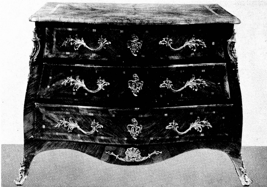
Chest of drawers, Louis XV, Berne.