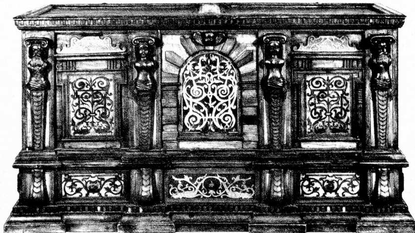
Chest, Renaissance style, Grisons.