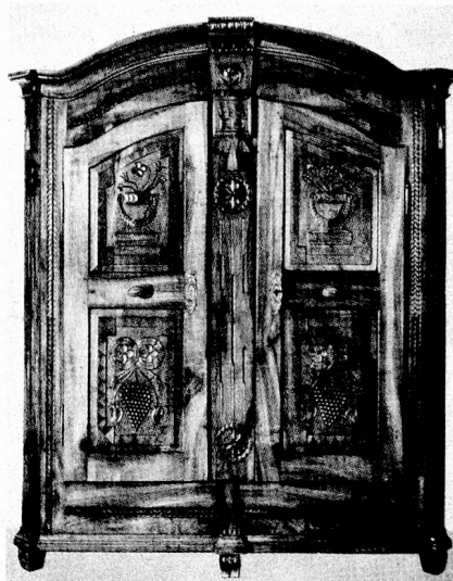
Wardrobe, 1830, Eastern Switzerland

By deliberately simplifying foreign models, we often achieved pieces of furniture in Switzerland, which are striking in their simplicity and clear lines. Nowhere does one find too many ornaments. As the Swiss as peasants or descendants of peasants have deliberately kept to tradition, it often happened that two or even three different styles were mixed in the same piece of