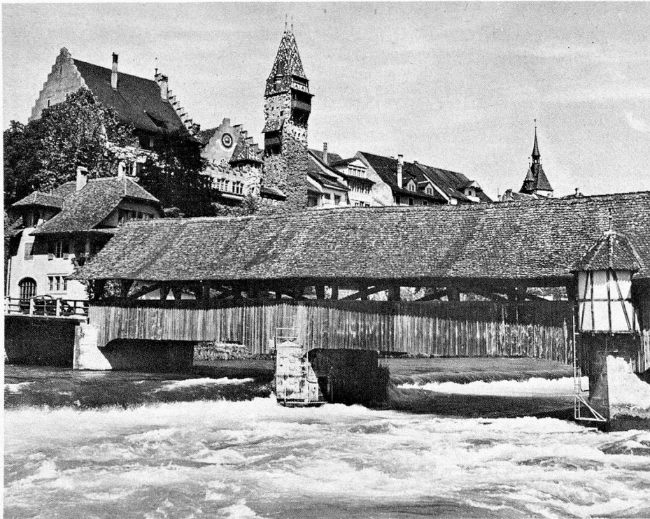
The covered wooden bridge across the Rhine at Bremgarten.

It would seem that Switzerland is alone amidst her neighbours in having such a number of covered wooden bridges. Practically non-existent in France and Southern Germany they are sometimes found in Austria and Northern Italy but not in the same quantity or use as in the Central Swiss Cantons where they remain as a delightful and artistic reminder of a bygone age.