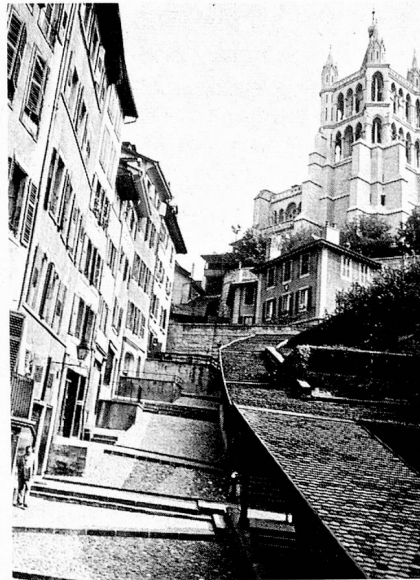
Lausanne – the Market stairs dating from Middle-Ages