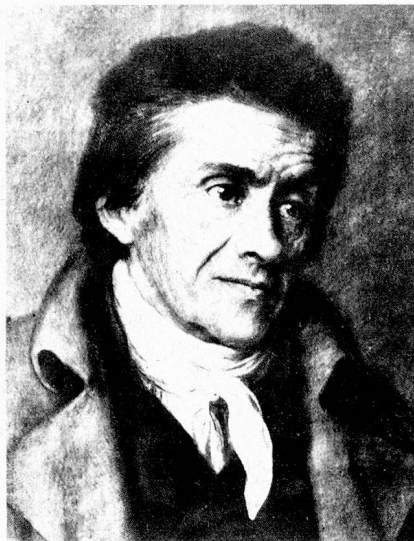
Johann Heinrich Pestalozzi