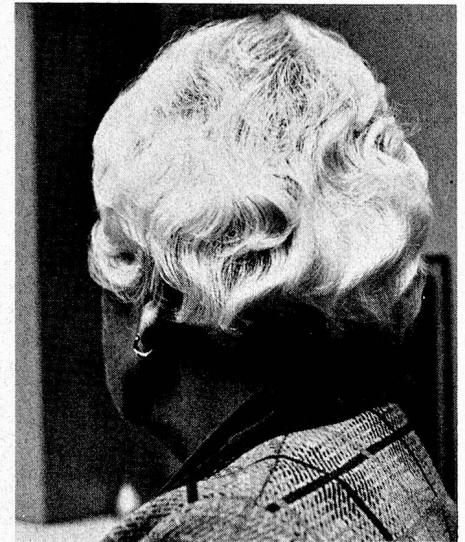
. . . and after treatment.