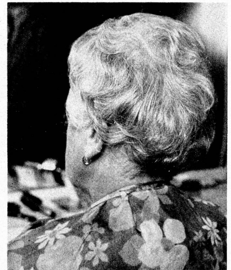
Before treatment . . .

– the face and scalp – is often the most abused. Hans' basic advice is similar to most naturopaths – to maintain a sensible, natural diet and take adequate exercise. But he goes on to point out that even many of those who enjoy the benefits of a natural diet, persistently imbue their scalp and face with harmful chemical detergents and "unnatural" cosmetic preparations. This results in the copious ailments of modern living – thinning, oily, dry, brittle and split hair, dandruff, alopecia, blackheads, acne, excessively oily, dry or flaking skin and generally bad complexions.