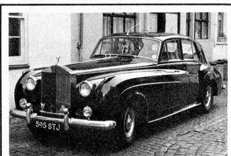
Would you like to own this car and save money on everyday driving costs?

Surprisingly, the ownership of a classic Rolls-Royce or Bentley can save you money, providing your car is serviced and maintained by genuine specialists.