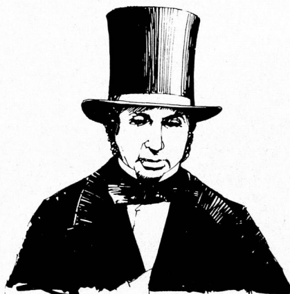
ISAMBARD KINGDOM BRUNEL, 1806-1859. English civil engineer. Foundry Chemicals Division, a subsidiary of Plastics Division, is a leading supplier of specialised chemicals for the foundry industry. The products include resins, silicates, hardeners, acid catalysts, conventional oil sand binders, facing materials and foundry paints.

Ciba-Geigy's Plastics Division is Britain's largest manufacturer of synthetic resin adhesives. Aerolite® urea resins, long established as outstanding wood glues, find their biggest use in the manufacture of chipboard and plywood, for veneering and all types of joinery.