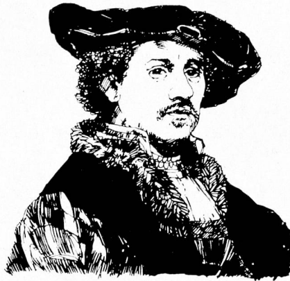
REMBRANDT HARMENSZOOM VAN RIJN, 1606-1669. Dutch painter and etcher.

Araldite® epoxy resins made by Ciba-Geigy's Plastics Division and familiar to the general public as adhesives, are an essential ingredient in the production of electrical and electronic components.