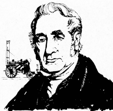
GEORGE STEPHENSON, 1781-1848. English inventor and engineer.

One of the activities of Industrial Chemicals Division is to provide a full range of chemicals and auxiliary products for boilers and cooling water systems. The Belgard® range includes chemicals for the treatment and control of scale, corrosion and biological fouling in water distillation units, such as desalination plant, steam raising boilers and water recirculating systems.