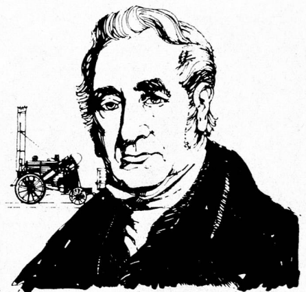
GEORGE STEPHENSON, 1781-1848. English inventor and engineer.

One of the activities of Industrial Chemicals Division is to provide a full range of chemicals and auxiliary products for boilers and cooling water systems. The Belgard® range includes chemicals for the treatment and control of scale, corrosion and biological fouling in water distillation units, such as desalination plant, steam raising boilers and water recirculating systems.