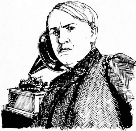
THOMAS ALVA EDISON, 1847-1931. American inventor, especially of electrical devices.

Araldite® epoxy resins made by Ciba-Geigy's Plastics Division and familiar to the general public as adhesives, are an essential ingredient in the production of electrical and electronic components.