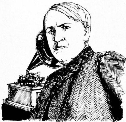
THOMAS ALVA EDISON, 1847-1931. American inventor, especially of electrical devices.

Araldite® epoxy resins made by Ciba-Geigy's Plastics Division and familiar to the general public as adhesives, are an essential ingredient in the production of electrical and electronic components.