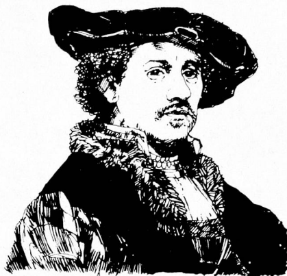
REMBRANDT HARMENSZOOM VAN RIJN, 1606-1669. Dutch painter and etcher.

Araldite® epoxy resins made by Ciba-Geigy's Plastics Division and familiar to the general public as adhesives, are an essential ingredient in the production of electrical and electronic components.