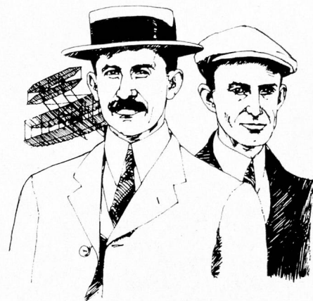
ORVILLE AND WILBUR WRIGHT, 1871-1948 and 1867-1912.

Pigments Division manufactures a wide range of lightfast, durable pigments, used in the production of high quality artists' colours. The division is also a leading supplier of organic pigments and dyes to the other colour-using industries.