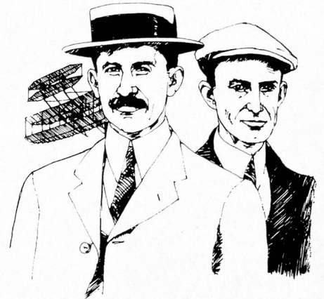
ORVILLE AND WILBUR WRIGHT, 1871-1948 and 1867-1912.

Pigments Division manufactures a wide range of lightfast, durable pigments, used in the production of high quality artists' colours. The division is also a leading supplier of organic pigments and dyes to the other colour-using industries.