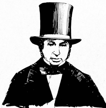
ISAMBARD KINGDOM BRUNEL, 1806-1859. English civil engineer. Foundry Chemicals Division, a subsidiary of Plastics Division, is a leading supplier of specialised chemicals for the foundry industry. The products include resins, silicates, hardeners, acid catalysts, conventional oil sand binders, facing materials and foundry paints.

Ciba-Geigy's Plastics Division is Britain's largest manufacturer of synthetic resin adhesives. Aerolite® urea resins, long established as outstanding wood glues, find their biggest use in the manufacture of chipboard and plywood, for veneering and all types of joinery.