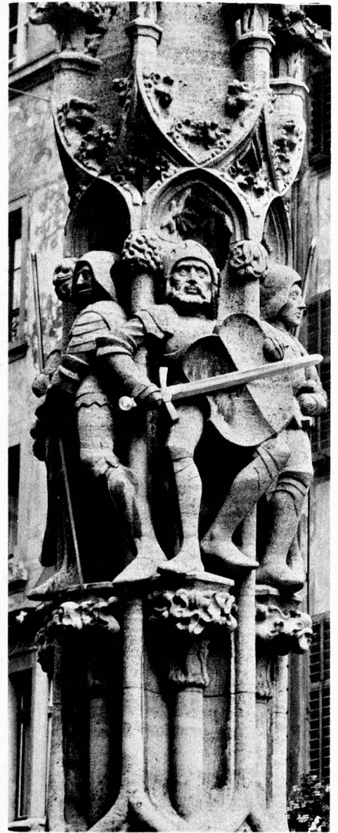
A fragment showing six marching armed warriors from Lucerne's 15th century wine market.

Lucerne is a long ribbon of a town sandwiched between lake, river and the rising hills behind it. When the "foehn" wind comes, the city is transformed, putting on its picture postcard face. But when the strange, warm south wind fades, heavy clouds gather and the lake turns grey.