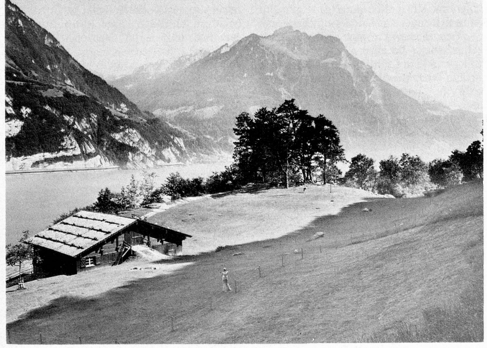
On this Rütli meadow on the shores of Lake Lucerne, Uri, Schwyz and Unterwalden signed a pact of mutual defence in 1291, thus founding the alliance which was later to become the Swiss Confederation.