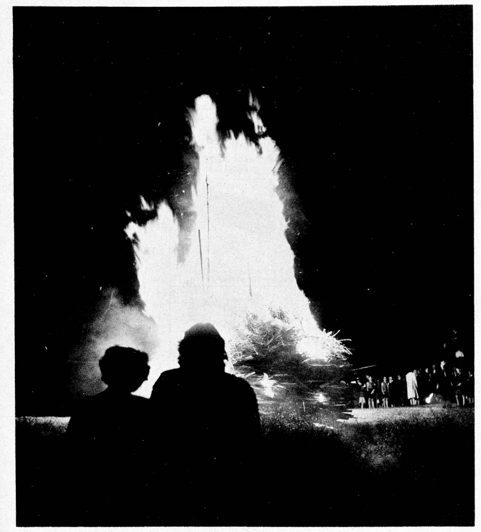
The lighting of bonfires as night falls is one of the ceremonies attached to our National Day.

One early August day in 1291 men from the valley communities of Uri, Schwyz and Unterwalden met and swore to help one another in warding off attacks and thwarting injustice. The pact written in Latin and sealed - is still preserved in the Swiss archives at Schwyz. Since 1st August, 1891, the 600th anniversary of this event – the birth of the Swiss Confederation – has been a day of national celebration, though until a few years ago the ceremonies were confined to the evening hours. As night fell church bells rang out through the land and the people of town and city assembled in school grounds and, by the light of bengal flares listened to brass bands, watched the local gymnasts build human pyramids and paid attention to solemn addresses by a representative of the local government. And then, at about 10 pm, the party broke up and each and everyone went his own way to finish the evening.