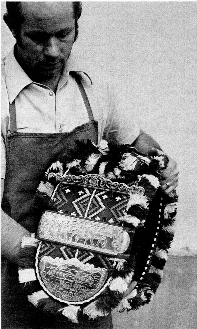
It takes some 25 hours of meticulous work to finish one of the bell straps with leather laces, woollen frills and brass engravings.

Should you feel that your Business Travel, Conferences, Freighting and Holidays, could be better than they are, we offer two words of comfort Rankin Kuhn