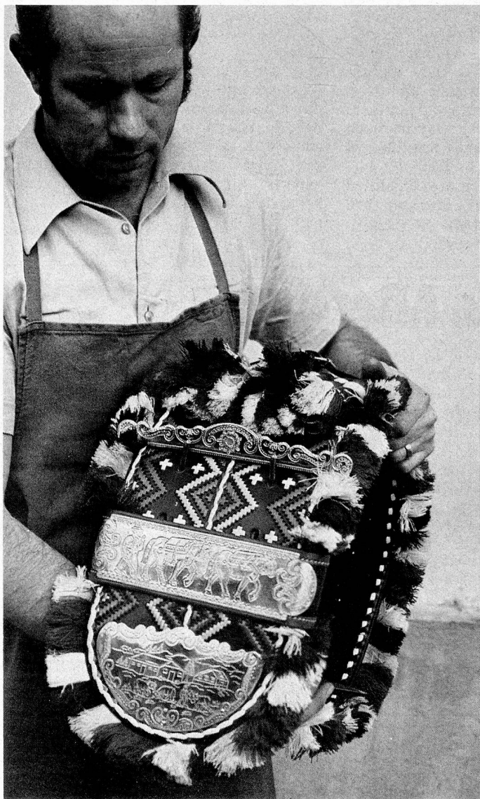
It takes some 25 hours of meticulous work to finish one of the bell straps with leather laces, woollen frills and brass engravings.

Should you feel that your Business Travel, Conferences, Freight and Holidays, could be better than they are, we offer two words of comfort Rankin Kuhn