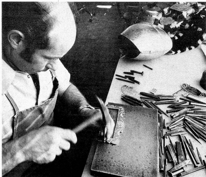
A hammer and various punches are needed for the delicate engravings on the brass buckles.