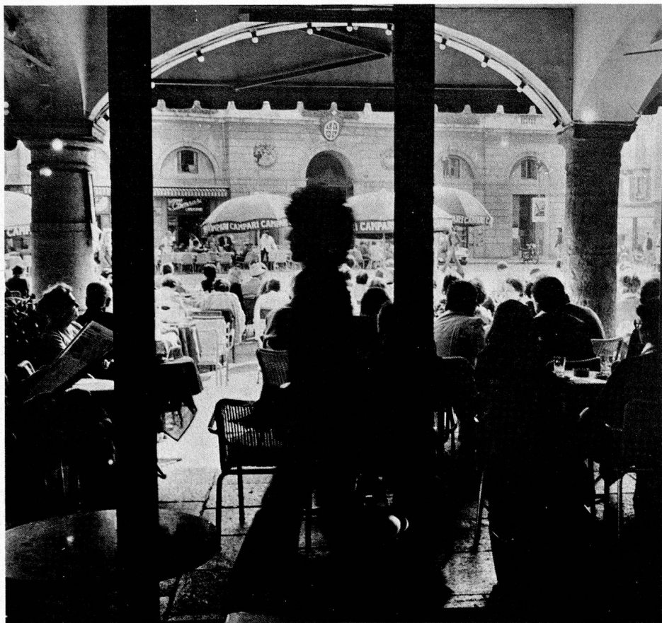
A popular meeting place for holidaymakers and local people—the cafe's on Lugano's Piazza Priforma. This and the other pictures are by courtesy of SNT0.