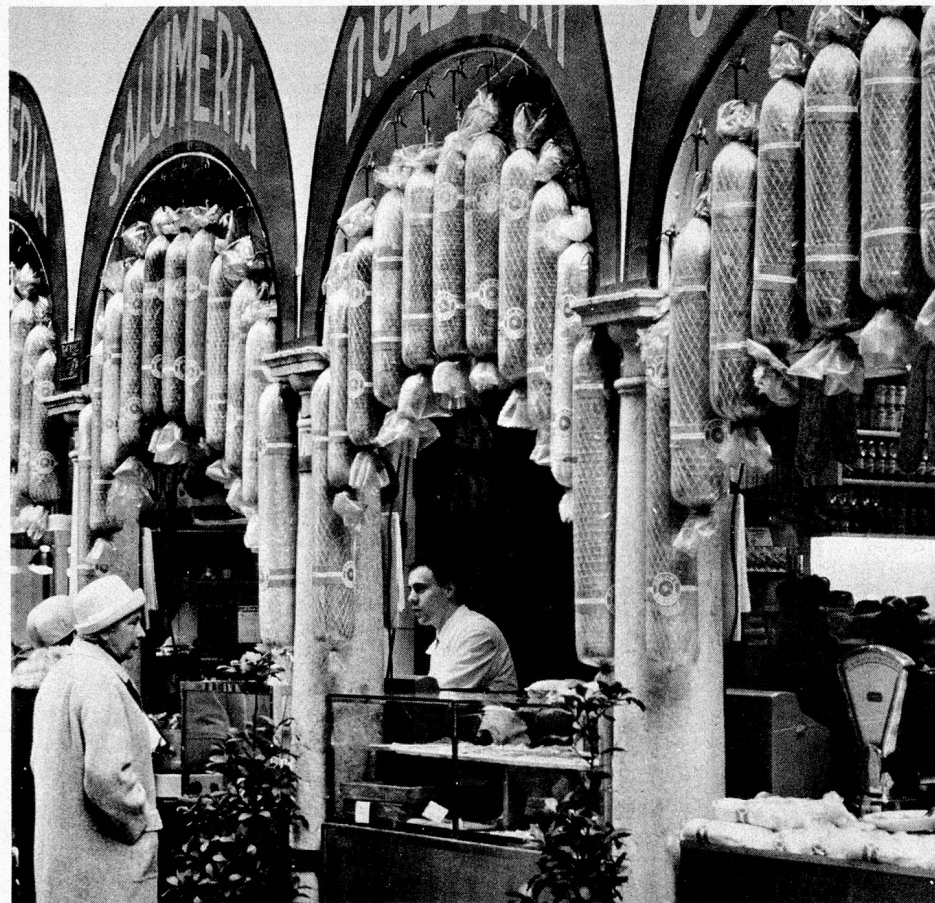
This sausage shop imparts a distinctly "southern" ambience.

The very word Lugano conjures up a serene blue lake, gorgeous sunshine and an azure sky. Well, like anywhere else the weather cannot be guaranteed. We recently spent a week there, and although we did get two really beautiful days, the rest of the time was rainy, dull and grey. Yet the holiday was an unqualified success.