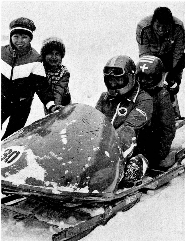
An intrepid passenger at the start: the children help to push mum into her big adventure.